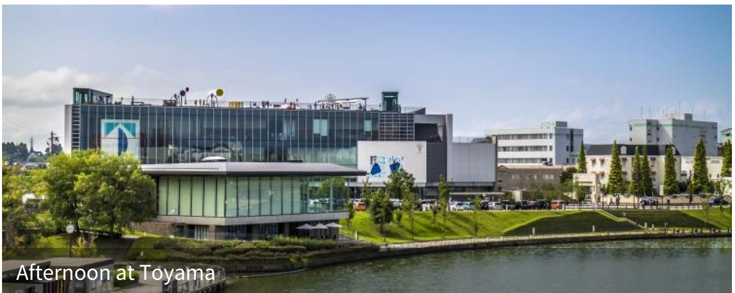
Afternoon at Toyama